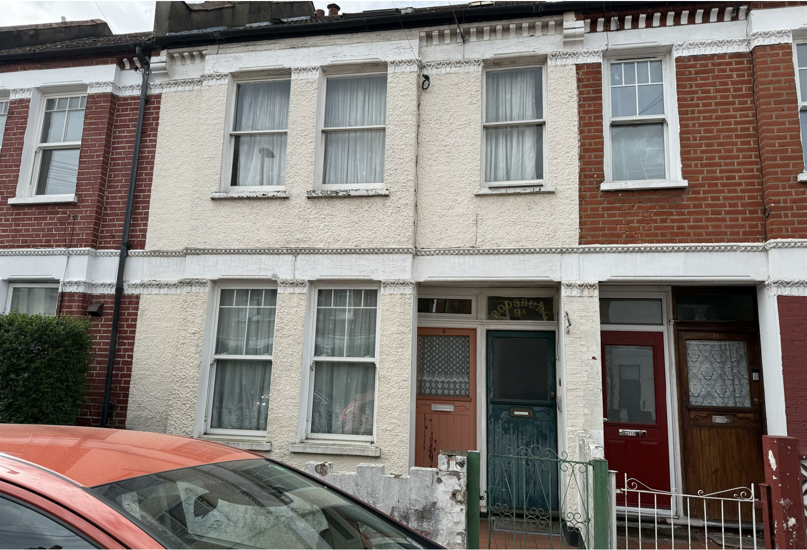
Coverton Road *, SW17 0QW £400,000